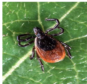
Black legged tick